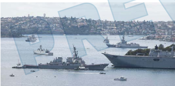
USS FITZGERALD passes HMAS CANBERRA on Ceremonial Entry to Garden Island for Navy 125.

All ships entering Sydney Harbour dipped their ensigns to HMAS SYDNEY 1 at Bradley's Head, a mark of respect reciprocated in time honoured fashion by sailors parading at the masthead.