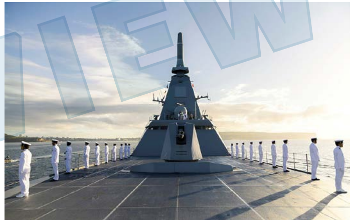
Mogami-class frigate JS KUMANO sails into Sydney Harbour IFR 125.

the Indonesian Navy; the French Navy (La Royale); the Republic of Fiji Navy; the Papua New Guinea Defence Force and the United Arab Emirates Navy. Without exception they did the RAN, their countries, and navies proud. The one noticeable absence was the Royal Navy. It is possible that HMAS ANSON was due to attend (the only operational UK SSN), prior to being deployed to the Gulf.