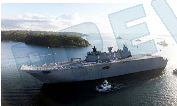
HMAS CANBERRA lines the upper deck, followed by JS KUMANO, FNS AUGUSTE BENEBIG, HMAS BRISBANE and HMPNGS FRANCIS AGWI

The ships drew up the night before in fleet formation outside the Sydney Harbour heads ready for the Ceremonial Entry on the morning of 21 March 2026.