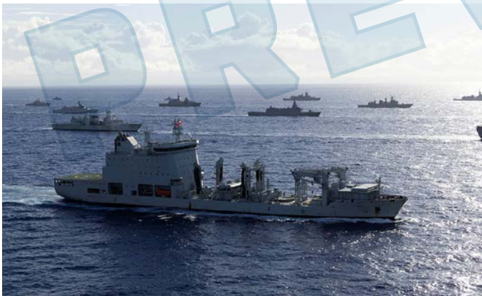
IFR 125 – EX KAKADU Ships Form Up for Ceremonial Entry to Sydney Harbour.

Following torrential rain, the days preceding the International Fleet Review (IFR) to commemorate the 125th anniversary of the Royal Australian Navy (cunningly disguised as Exercise KAKADU 2026 ), the morning broke fine – albeit confirming the old sailor's adage “ Red Sky at Night; Sailors Delight – Red Sky in Morning; Sailors Warning. ” For those not fortunate to be accommodated on board the fleet assembling or invited to attend official functions – there was opportunity to join a Captain Cook's Cruise ship. It was a moving sight to behold – sailing was at 0700 (sharp) and by 0600 there was already a line 1/2km long of sailors old, new and retired waiting patiently to board. In the wet and cold of a damp Saturday morning.