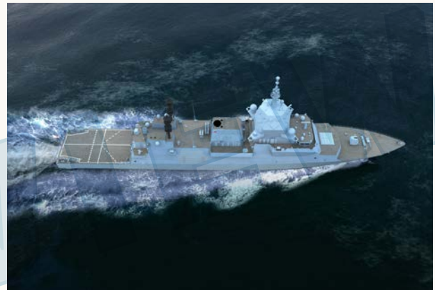
A recent updated computer-generated image of the Hunter-class frigate. (BAE Systems Australia)

This context should frame the Government's 'haircut' to the Hunter-class frigate program. Reducing the number of the most advanced ASW vessels to ever be built serves only to advantage our adversary's submarine forces. While the Mogami-class is a capable platform, it cannot match the ASW performance the Hunter-class was designed to deliver, capability that is foundational, not optional, for a maritime trading nation.