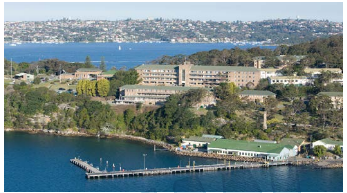
HMAS PENGUIN also RN Dive and Medical School due to be partially sold off – opposed locally, but supported by the local MP.

The “Future Commando Force” concept, while intellectually ambitious, has often served as a linguistic shroud for the reduction of mass. As Policy Exchange highlights, the hollowing out of support infrastructure means that “not a single formation in the British military is currently sustainable in combat as a sovereign entity”.