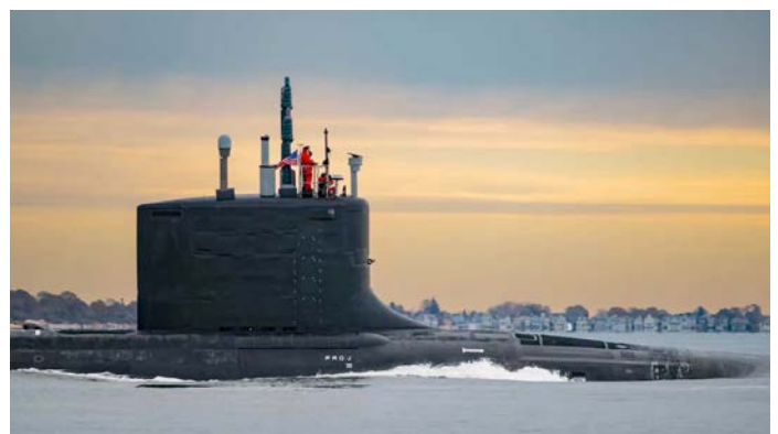
The USN received its 26th Virginia-class submarine USS IDAHO (SSN799) December 25.

The Government's apparent prioritisation of gender equality in senior appointments, DIE, climate change action, green energy, multicultural inclusion, guns, hate speech laws, while maintaining social safety nets, high welfare spending, defence cuts and high tax and spend policies, might place the Government at odds with Trumpian, USF/GAIN strategy. An administration that, under JD Vance, may be in power for another 10 years.