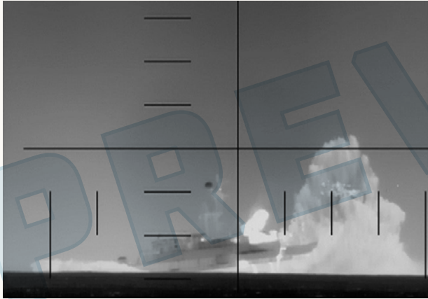
A single Mk-48 torpedo lifted the Iranian frigate DENA out of the water and broke her back. The ship sank in minutes and underscored the importance of ASW.

Predictably, some critics of the sinking reached for the same arguments deployed after the sinking of the GENERAL BELGRANO in 1982. Yet the circumstances were unambiguous. The Iranian frigate had manoeuvred into a position that threatened coalition operations and international shipping. Its approach toward Diego Garcia, one of the campaign's critical airpower hubs, placed it within 31 hours of being able to interfere with or target ongoing sorties. Simultaneously, it was operating in one of the region's busiest maritime corridors, where even a single aggressive act could have triggered chaos.