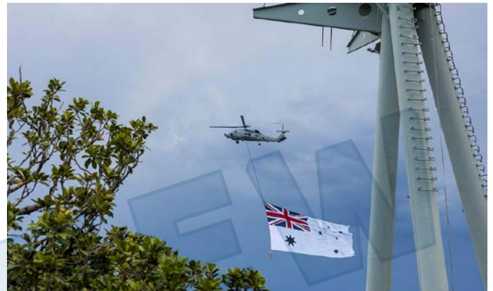
RAN MH-60R helicopter dips the AWE on flying over HMAS SYDNEY I AWE Bradleys Head.

USS FITZGERALD entered the Harbour somewhat later than the main fleet due, undoubtedly, to the operational pressures facing the USN at this moment. She cut a fine figure as she came up harbour, to moor astern HMAS CANBERRA in Garden Island, Fleet Base East.