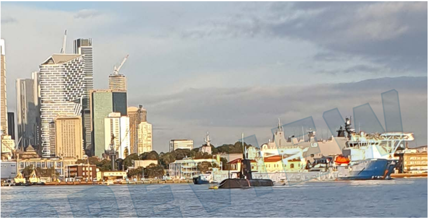
A Collin-class submarine at the IFR 125 silhouetted against the Sydney CBD.