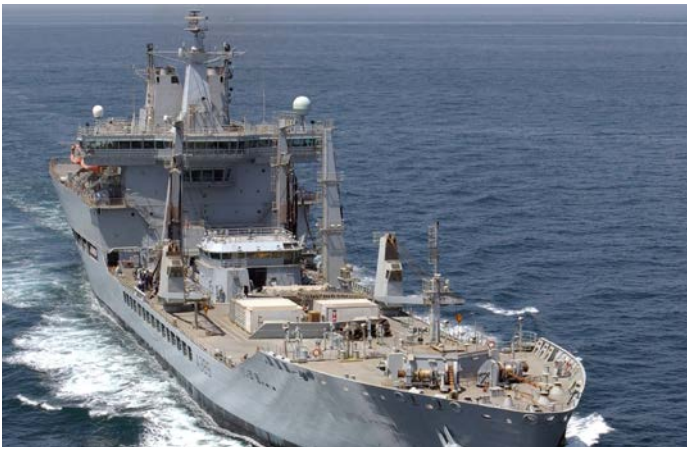
The UK Continues to sell off RFA Vessels – RFA Wave Knight one of two sold in 2026. (Image UK MOD).