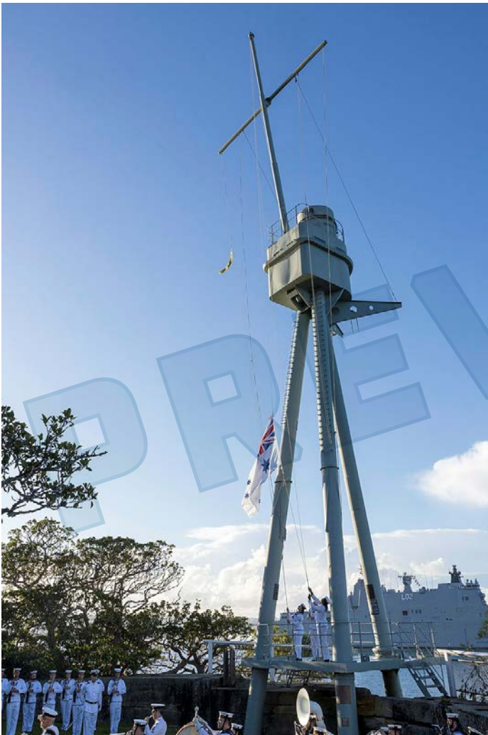
Bradleys Head Australian White Ensign hoisted SYDNEY I Ceremonial Colours HMAS CANBERRA Saluting.

All ships entering Sydney Harbour dipped their ensigns to HMAS SYDNEY 1 at Bradley's Head, a mark of respect reciprocated in time honoured fashion by sailors parading at the masthead.