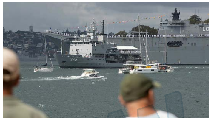
Reviewing Ship HMAS LEEUWIN reviews HMAS CANBERRA Navy 125.

The Fleet Air Arm also participated, here seen "dipping" the Australian White Ensign (instead of a dipping buoy) as an MH-60R flew past HMAS SYDNEY I masthead.