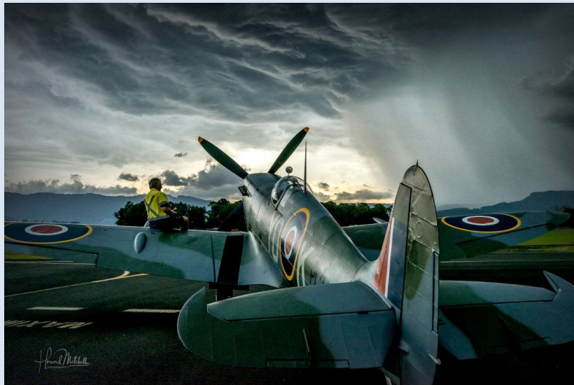
Spitfire back on the ground with weather front approaching.