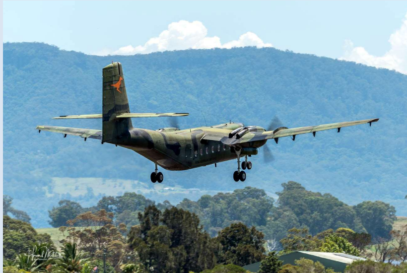
HARS Caribou flying earlier in the day prior to the weather closing in.