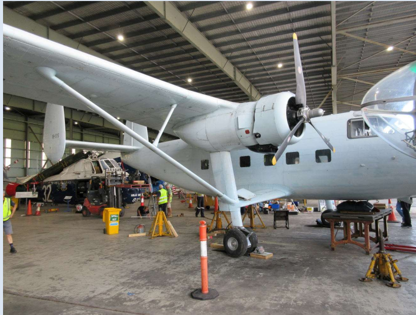
Scottish Aviation Twin Pioneer's turn to be weighed.