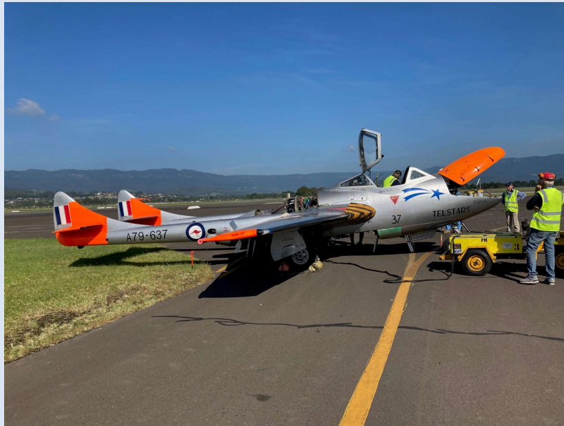
Engine run in progress.