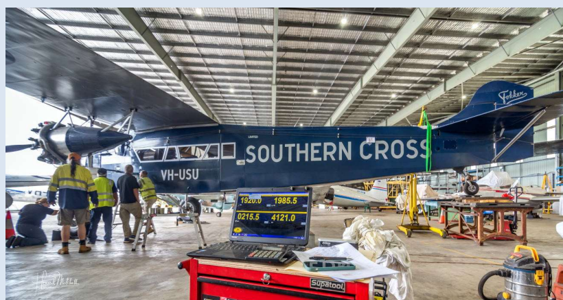
Southern Cross on the scales.

With the Southern Cross weighed, she is one step closer to flying again.