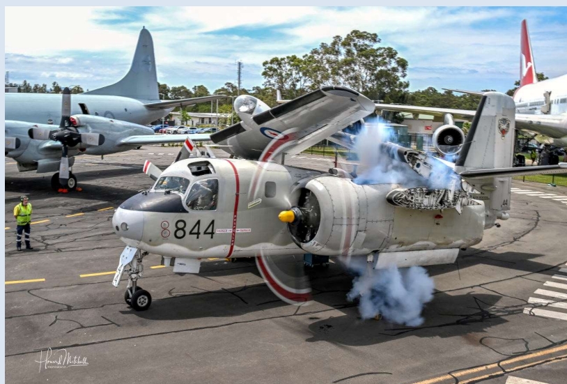
Grumman Tracker engine runs, January Tarmac Weekend.

HARS endeavours to fly and/or conduct engine runs on several aircraft over these weekends.