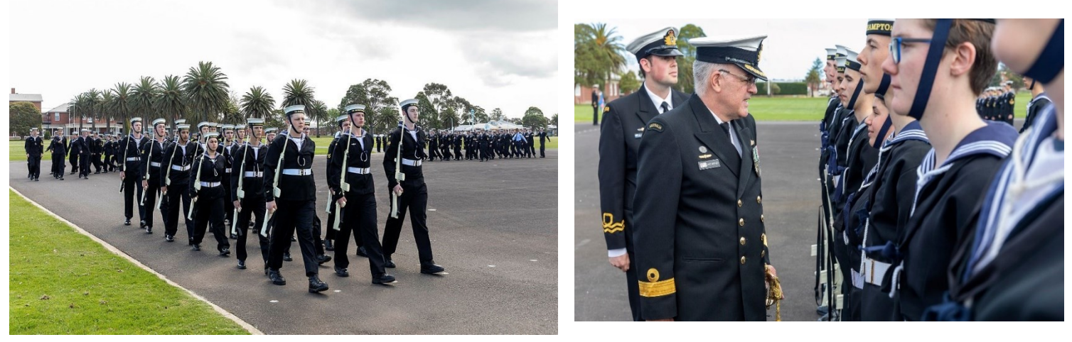
Service, Courage, Respect, Integrity and Excellence