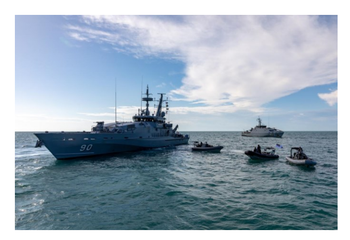
HMAS Broome (left) and Republic of Fiji Navy Ship Savenace conduct training operation in Darwin.

"For the patrol boats, they'll be conducting exercises that rehearse them for activities for border force and operations such as illegal fisheries enforcement and border protection. All the units will practise humanitarian assistance and disaster.