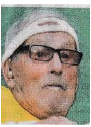
The Australian Open Tennis Championships commenc on Monday 16 January 2023 until Sunday 29 January 2023