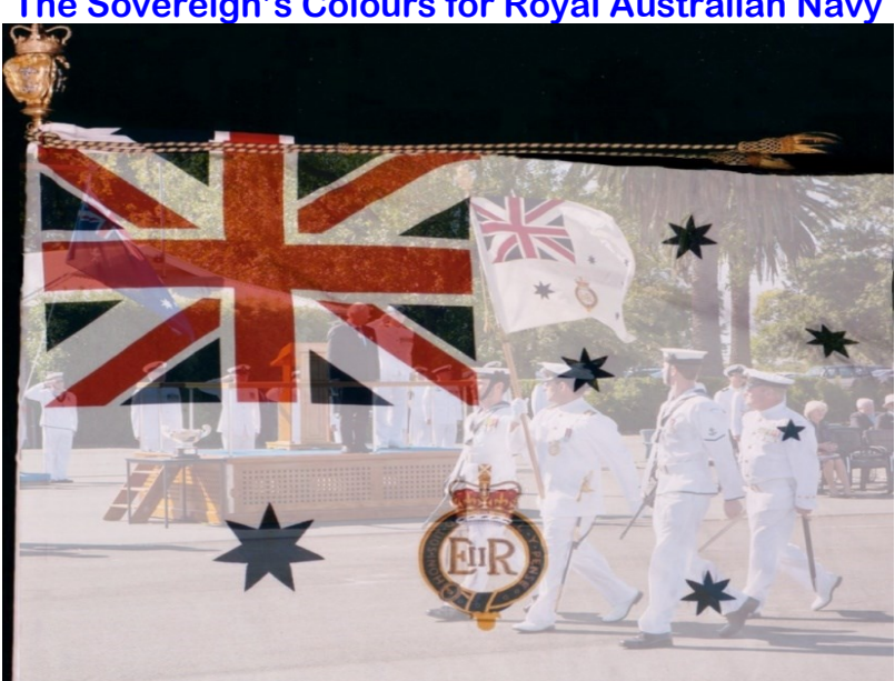
The Sovereign's Colours for Royal Australian Navy

While people across the globe have come together to mourn Her Majesty Queen Elizabeth II, the nearly 3000 people gathered in Darwin for Exercise Kakadu 2022 have also honoured the Queen's example by strengthening international bonds of friendship.