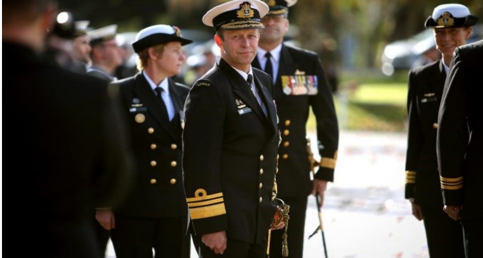
Chief of Navy Vice Admiral Michael Noonan inspects the guard during the commissioning ceremony for HMAS Encounter at Torrens Parade Ground, Adelaide, South Australia.

Navy League SA Division was honoured to be invited to the commissioning ceremony of HMAS Encounter III (formerly shore establishment Navy HQ-SA). The previous HMAS Encounter, Port Adelaide, was decommissioned 28 years ago. Vice Admiral Michael Noonan gave a stirring address on his last official engagement in South Australia.