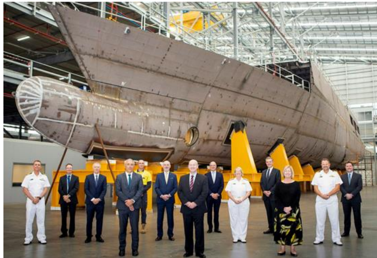
OPV Pilbara at Henderson Shipyard WA

With the Arafura Class production line now busy building replacements for the Armidale Class Patrol Boats, HMAS Pirie (II) was decommissioned at Darwin in March. It had commissioned at its namesake "City of Port Pirie" in 2006. HMAS Pirie (I) was one of sixty Australian built World War II Corvettes.