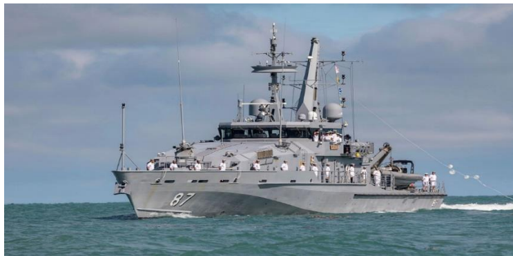
HMAS Pirie (II) entering Darwin for the last time

With the Arafura Class production line now busy building replacements for the Armidale Class Patrol Boats, HMAS Pirie (II) was decommissioned at Darwin in March. It had commissioned at its namesake "City of Port Pirie" in 2006. HMAS Pirie (I) was one of sixty Australian built World War II Corvettes.