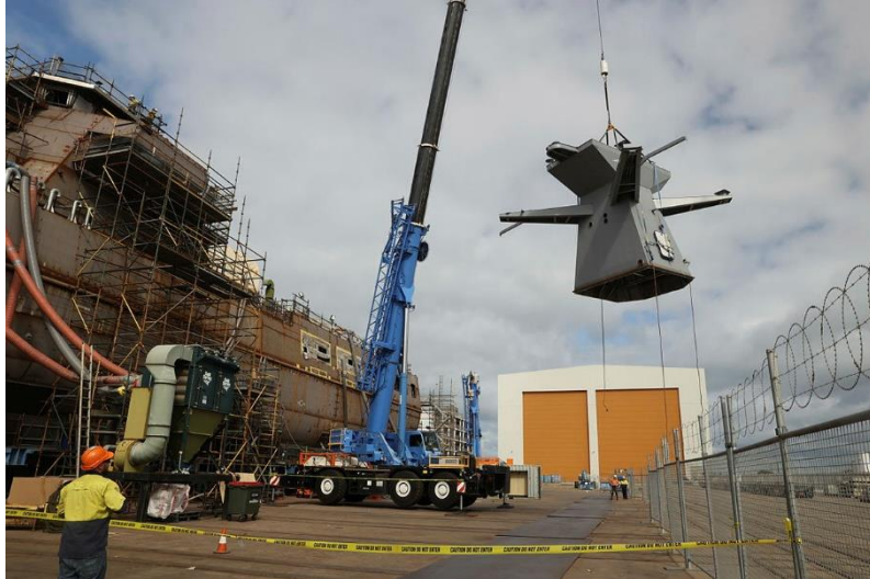
OPV Arafura 's mast being hoisted aboard at Osborne Naval Shipyard SA.

Construction of the first of this class is well under way in both South and Western Australia.