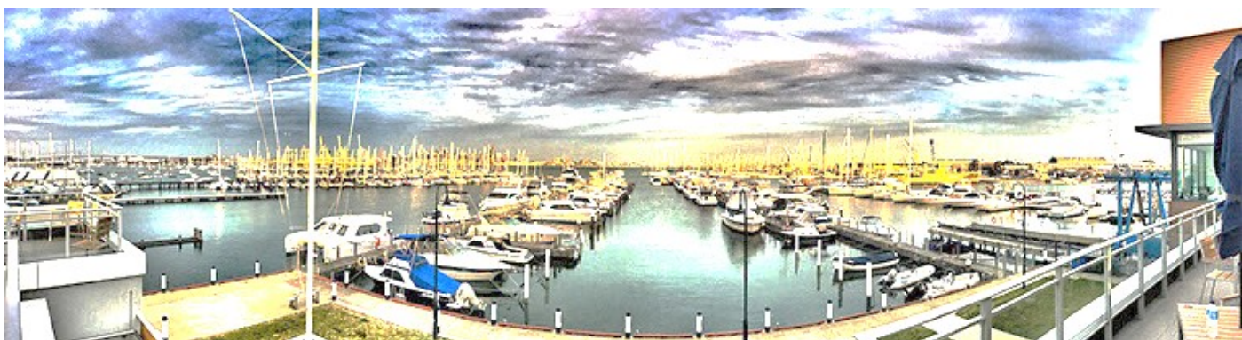
View from the Members Bar

It provides for boating and social interests with particular emphasis on family and community involvement. The Members' bar and dining area on the first floor is open to members and guests. Their function room downstairs caters for up to 300 people. The Club has an extensive program of events throughout the year, including concerts on the lawn, marine education courses, navigation rallies, social cruising and a junior training program. For further information, go to http://www.rvmc.net.au/