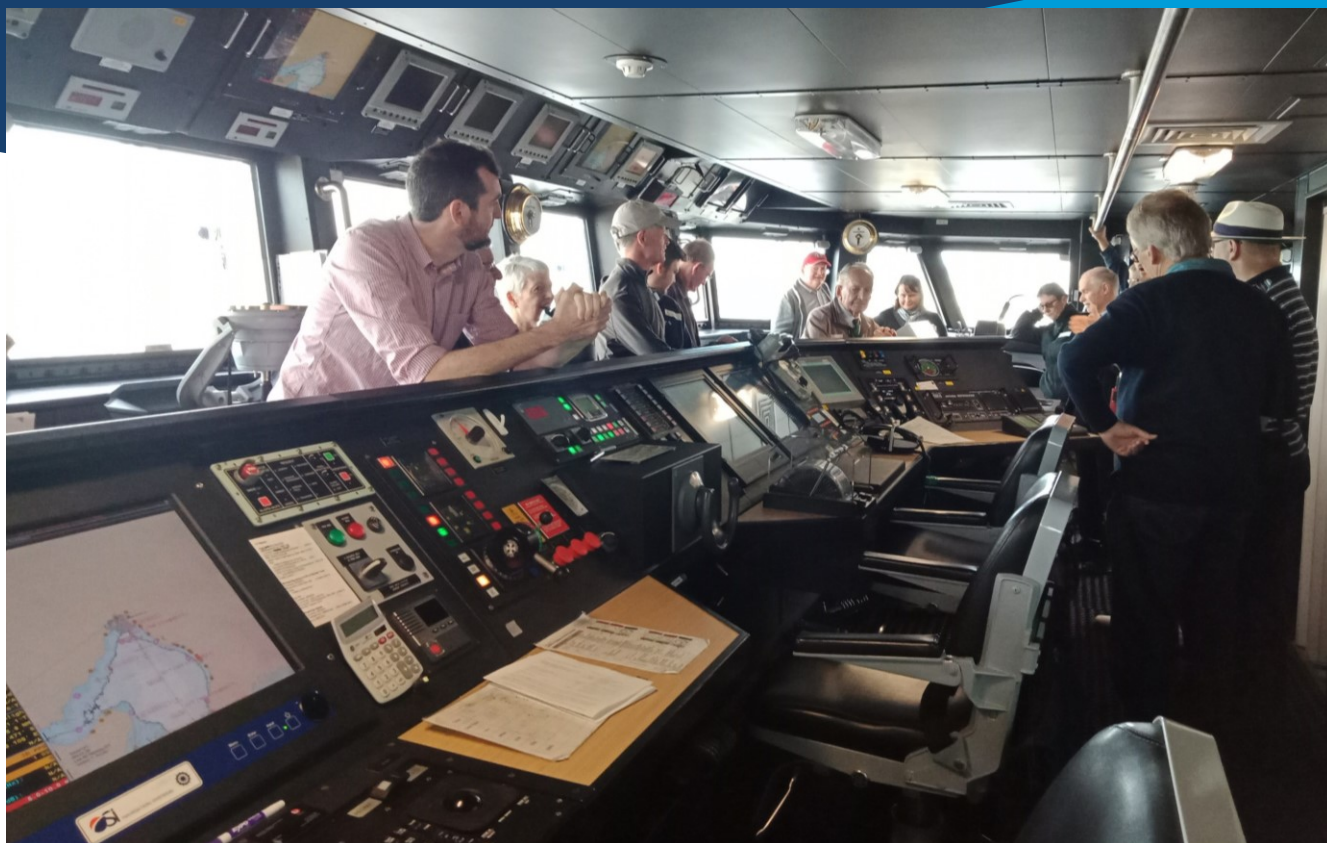
On the Bridge