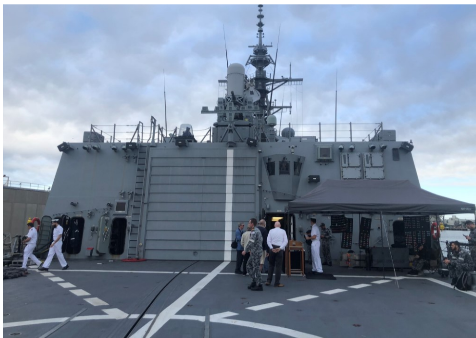
The Flight Deck

Hobart carries a $40 million MH-60R Seahawk helicopter for surveillance and response to support key warfare areas. The surface warfare function will include long range anti-ship missiles and a naval gun capable of firing extended range munitions in support of land forces.