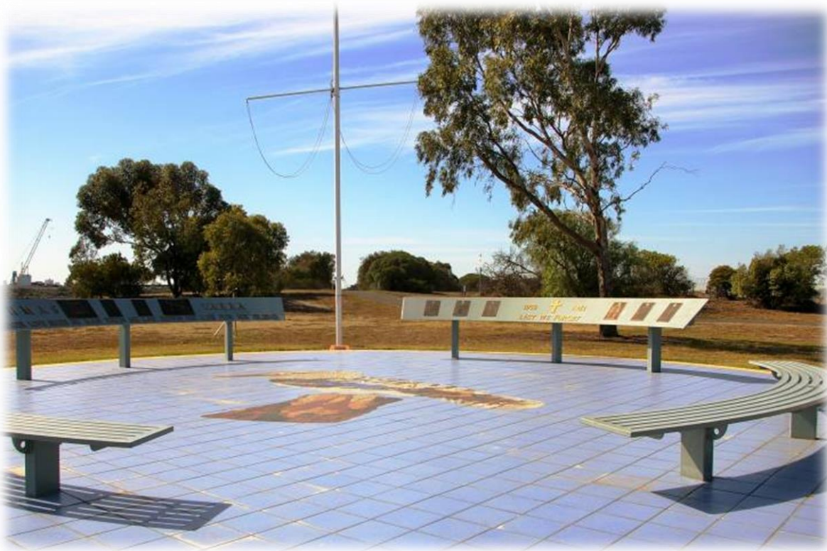
HMAS Yarra II Memorial at Williamstown