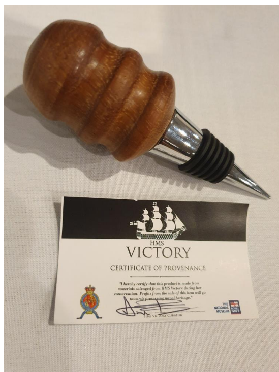
HMS Victory Wine stopper

We will miss him at the podium, but he will still attend meetings and be around for a long time.