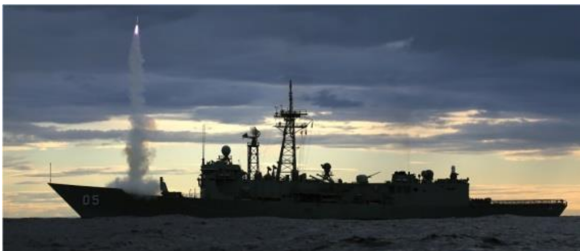
HMAS Melbourne fires a Standard Missile 2 from its Guided Missile Launching System during RIMPAC 2018.

HMAS Melbourne was commissioned in 1992 and has sailed more than 780,000 nautical miles throughout her service life. The 138-metre-long Adelaide Class frigate deployed on operations to the Middle East eight times and earned Battle Honours for service in Timor-Leste, the Persian Gulf and the Middle East. Most recently Melbourne completed a four-month deployment through north Asia, including conducting international maritime surveillance operations to enforce sanctions against North Korea.