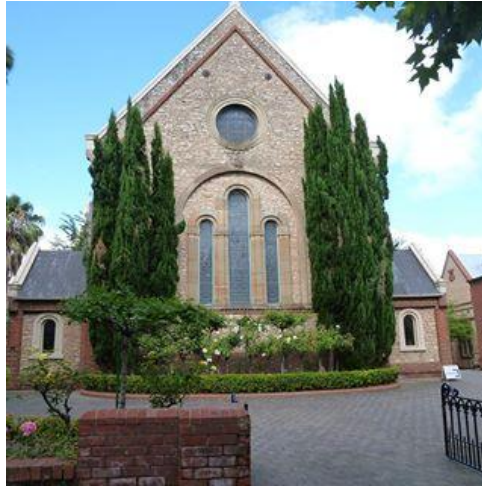
Christ Church, North Adelaide