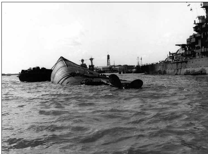
The capsized hull of USS OKLAHOMA (BB-37), with a barge alongside to support rescue efforts, probably on 8 December 1941.

were destroyed, along with 80% of the base. Eighteen servicemen were killed.