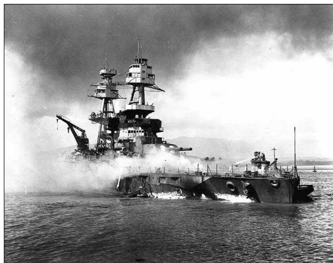
The battleship USS NEVADA beached at hospital point being hosed down