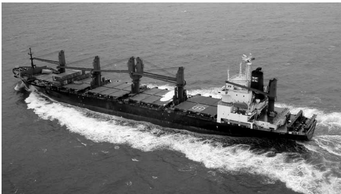
The Pacific Adventurer . At 3.12 am (Queensland Time) on 11 March 2009, the 1990 built, 23,737 dwt ship lost 31 containers of ammonium nitrate overboard some seven nautical miles east of Cape Moreton while enroute to Brisbane from Newcastle. The ship reported later that it was holed on its port side near its engine room and a fuel service tank had been breached with the loss of some 270 tonnes of heavy fuel oil into the sea.

I mentioned before Australia has an old fleet compared to international standards. This is in part due to our depreciation rate for vessels