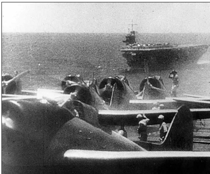
Japanese Aircraft ready to take off for the attack on Pearl Harbor with another carrier astern.

Two hundred and twenty miles north of Oahu at 0605hrs, the Kido Butai began to launch the 1st strike wave of 183 aircraft. Commanded