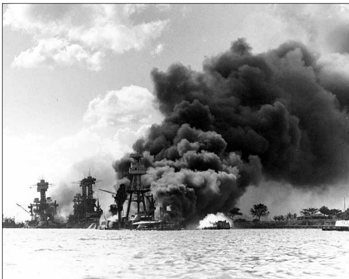
View looking up "Battleship Row" on 7 December 1941, after the Japanese attack. The sunken and burning USS ARIZONA (BB-39) is in the centre. To the left of her are USS TENNESSEE (BB-43) and the sunken USS WEST VIRGINIA (BB-48).

by Captain Fuchida Mitsuo, the first strike wave was divided into three groups.