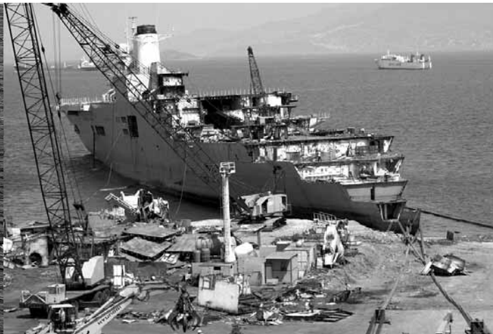
Still slightly recognisable here is the former HMS INVINCIBLE on a beach in Turkey being pulled apart for scrap.