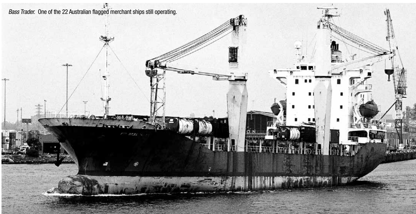
Bass Trader. One of the 22 Australian flagged merchant ships still operating.

We are determined to create an environment that will encourage and sustain growth and productivity in our shipping industry.