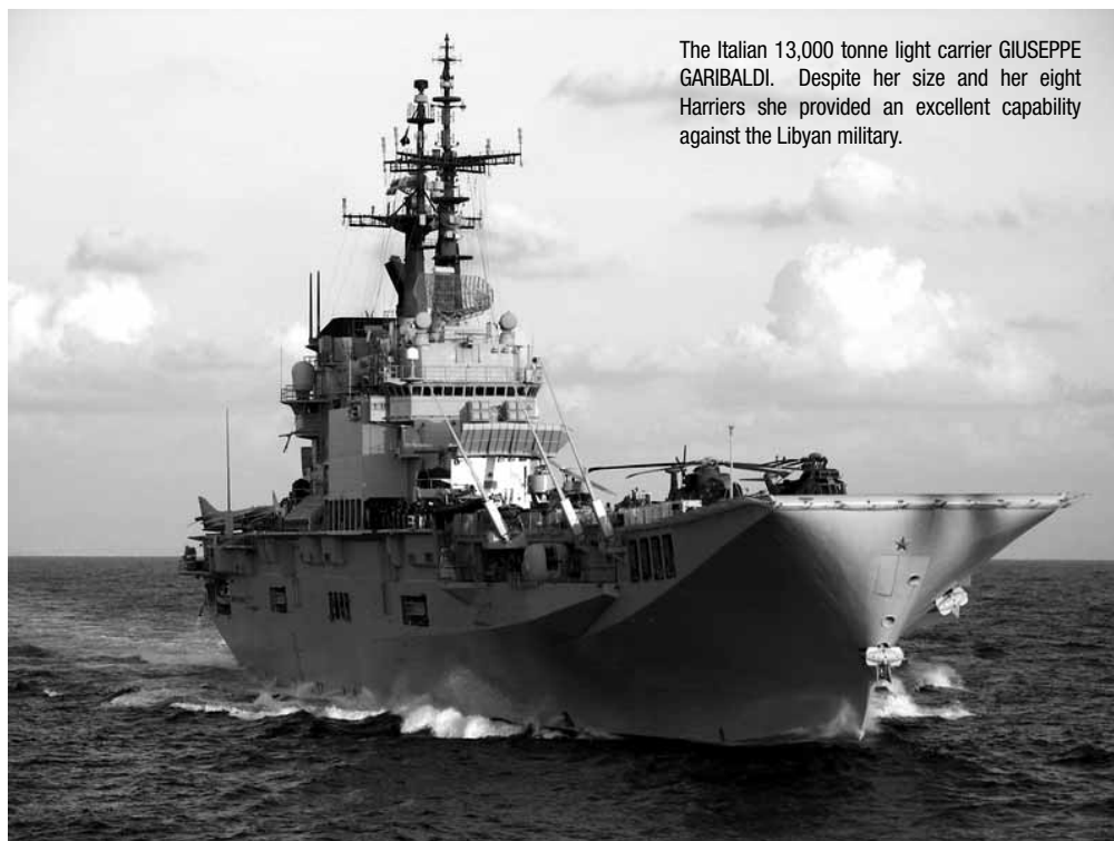
The Italian 13,000 tonne light carrier GIUSEPPE GARIBALDI. Despite her size and her eight Harriers she provided an excellent capability against the Libyan military.

So from the year of the aircraft carrier there are lessons for Australia. The first is that the modern multipurpose LHD can do much more than just taxi an army around. If it were only used in that manner it would be a waste of taxpayer's money. Like its