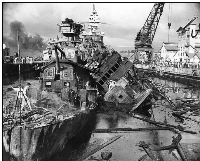
In Drydock Number One at the Pearl Harbor Navy Yard on 7 December 1941, immediately following the Japanese attack. The destroyers, USS CASSIN (left) and DAWES (right) were severely damaged by bomb hits and resulting fires. In the background, also in Drydock Number One, is USS PENNSYLVANIA (BB-38), which had received relatively light damage in the raid.

As aircraft from the first wave began the journey back to the Kido Butai , 0855hrs saw the 2nd strike wave led Lieutenant-Commander Shimazaki Shigekazu began its attack. By now, American defences, those not already destroyed, were ready to respond with anti aircraft fire. Eight Zeros from HIRYU strafed the Kaneohe Naval Air Station before heading for Bellows Field. They were followed immediately by 18 Kate dive bombers from SHOKAKU which bombed the base, destroying Hangar 1. Ten minutes later Fighters from SORYU who were providing air cover, then proceeded to attack. One was shot down by ground fire and another damaged. Thirty three PBV Catilinas