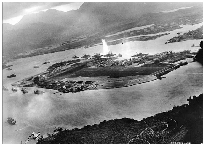
TORA TORA TORA. View looking down "Battleship Row" from Ford Island Naval Air Station. Pearl Harbor is quiet and still except for the large plume of water from a torpedo strike on one of the ships in Battleship Row. The silhouette of an attacking Japanese aircraft can be seen to the right of the plume.