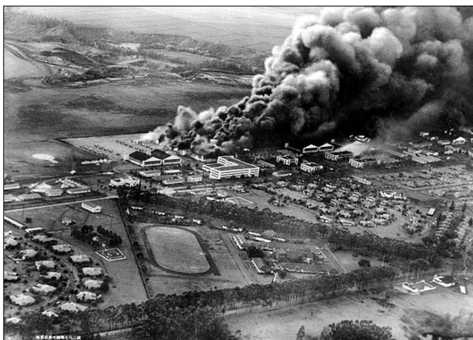
An aerial view of the attack on Wheeler Field.

At 0755hrs the first torpedo attack began. Ninety Nakajima B5N Kate bombers from AKAGI, KAGA, SORYU, and HIRYU, armed with torpedos, along with nine D3A Val dive bombers from SHOKAKU attack the US battleships moored at Battleship Row. Over the next two hours the prime targets of the attack, the battleships TENNESSEE (BB-43), WEST VIRGINIA (BB-48), NEVADA (BB-36), OKLAHOMA (BB-37), ARIZONA (BB-39), CALIFORNIA (BB-44), MARYLAND (BB-46), with PENNSYLVANIA (BB-38) in Dry Dock No.1, along with the rest of the fleet, would be subjected to the most violent attack America had seen since the Civil War. It was the first 20 minutes of the attack that the most damage was done.