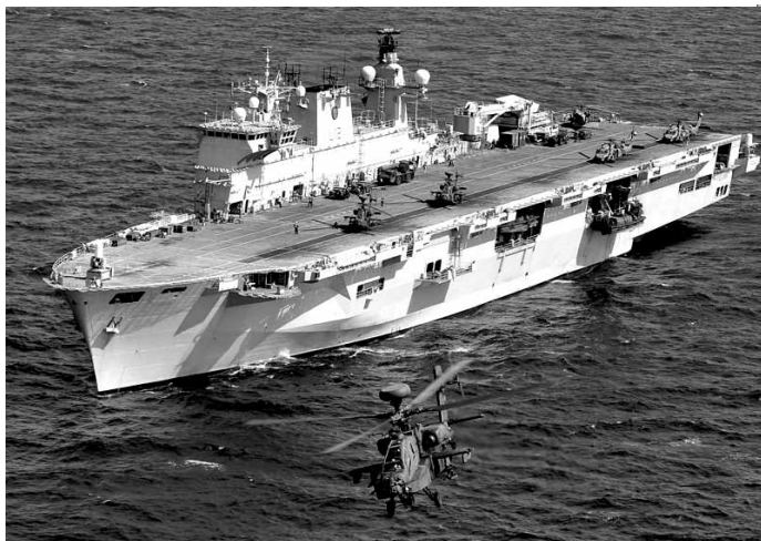
The RN Multipurpose LPH HMS OCEAN with British Army Apache attack helicopters embarked. With ARK ROYAL and all the Harriers decommissioned the only thing the RN had to 'throw against Libya' during this year's operation was the Army's helicopters.

So from the Libyan operation and the year of the carrier the ADF needs to have the difficult discussion with itself about other capability options for fixed-wing air support when out of RAAF range. Or stay at home. ■