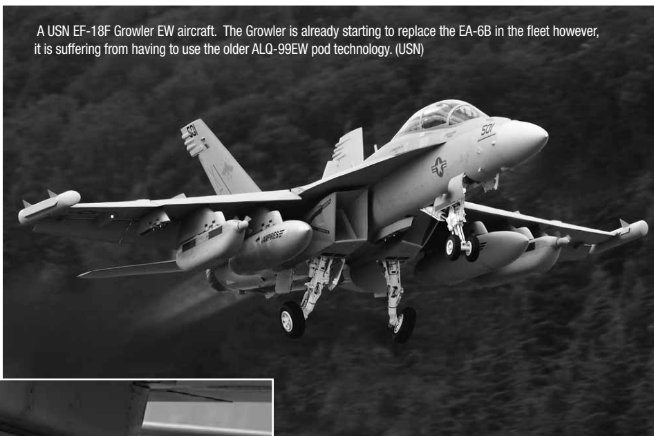
A USN EF-18F Growler EW aircraft. The Growler is already starting to replace the EA-6B in the fleet however, it is suffering from having to use the older ALQ-99EW pod technology.