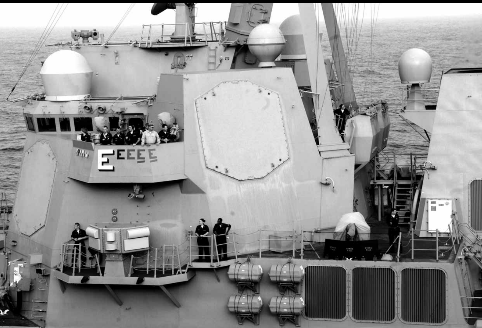
Mounted below the Bridge wing of this Arleigh Burke class destroyer is the SLQ-32 ESM sensor. This unit is fitted to nearly all USN warships and is the only sensor for EW purposes.

recapitalise our capabilities fleet-wide. Technology today is exploding all around us and there are huge leaps in technological capabilities that could be turned into weapons systems.