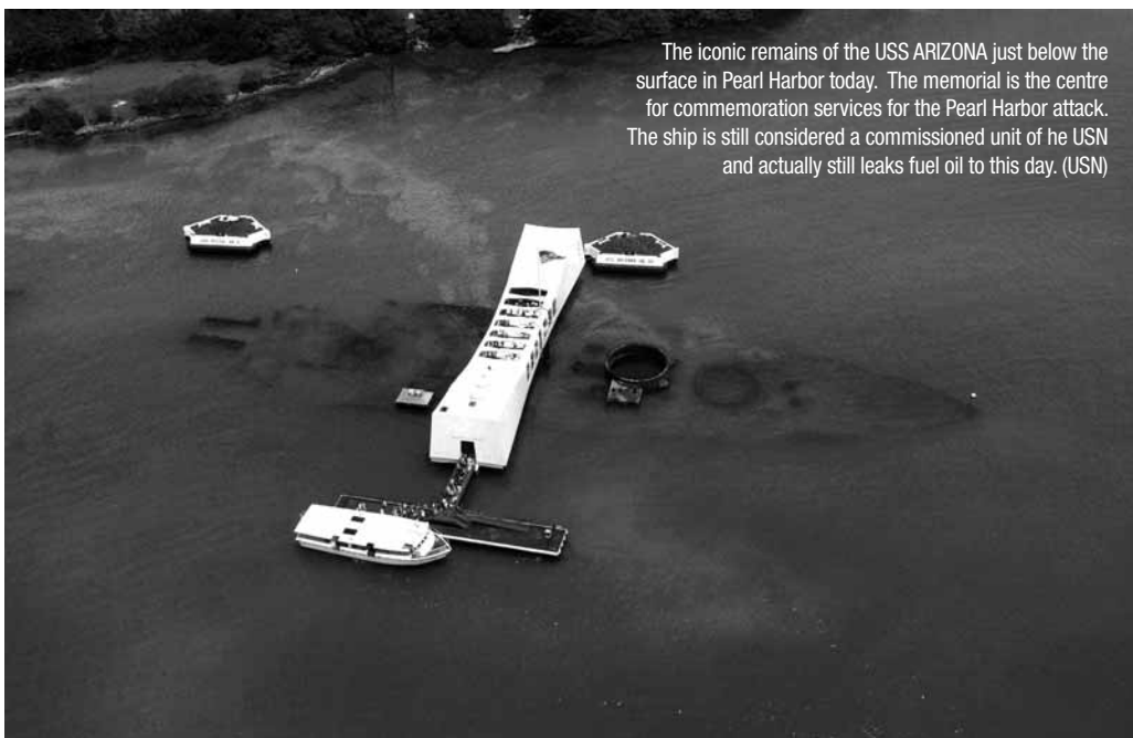
The iconic remains of the USS ARIZONA just below the surface in Pearl Harbor today. The memorial is the centre for commemoration services for the Pearl Harbor attack. The ship is still considered a commissioned unit of the USN and actually still leaks fuel oil to this day.

The USN also lost USS UTAH (AG-16) and USS OGLALA (CM-4), while the light cruisers USS HELENA (CL-50) and USS RALEIGH (CL-7) were both hit by a torpedo. VESTAL, moored alongside ARIZONA, was