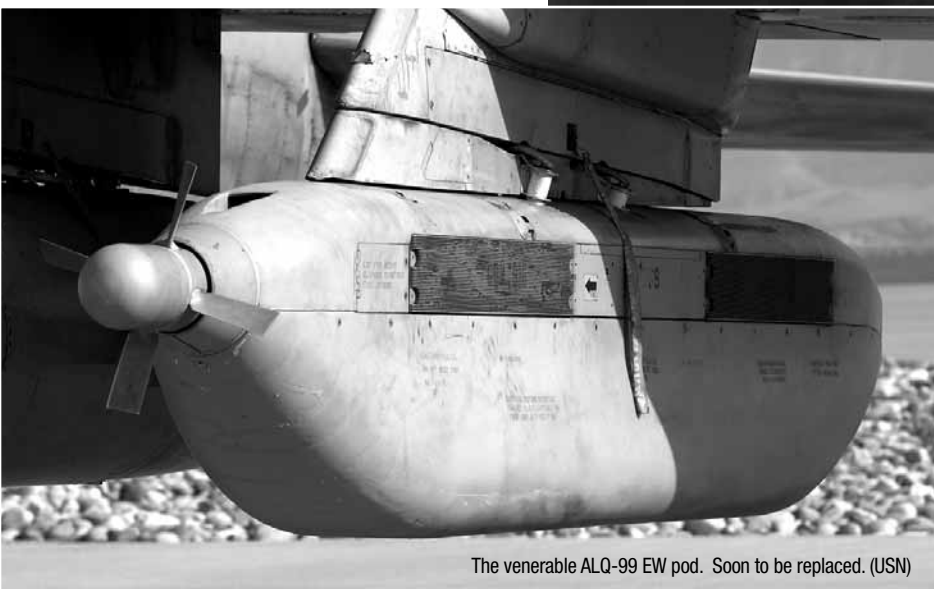
The venerable ALQ-99 EW pod. Soon to be replaced.

solutions that will accommodate more automation or off-board control of the information necessary to mission tasking."