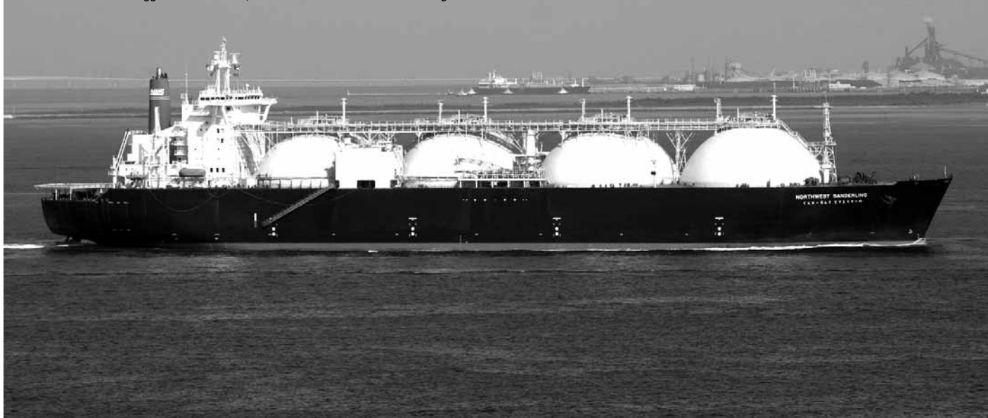
Another Australian flagged merchantman, the LNG carrier Northwest Sanderling .

To further support the industry, International Register vessels must employ a minimum of two Australian crew, preferably the Master and the Chief Engineer.