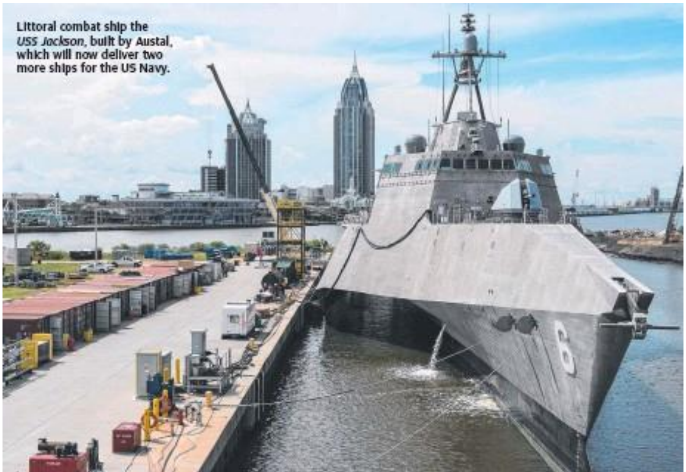
Littoral combat ship the USS Jackson, built by Austal, which will now deliver two more ships for the US Navy.